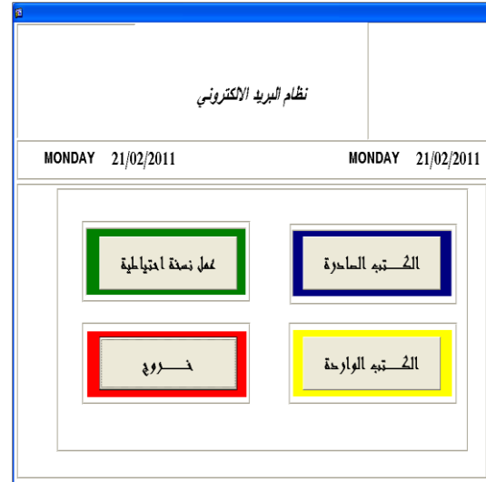
Fig 2: The login screen to the program