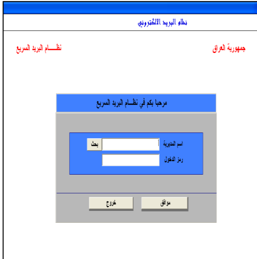
Fig 1: Main display screen