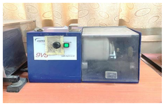
Figure 1: Roller ball mill during operation

After bonding procedures had been done the middle of root surface used for identification between the specimens, by making marks with the aid of hand piece. All of marks then colored with the aid of red colored pen marker to ease the differentiation between the specimens. The red marker left to dry. After completion of samples preparation, the specimens then collected together in one container contained distelled water and incubated in 370C for 24hours<sup>(18)(19)</sup> prior to the test to mimic the intraoral environment <sup>(20)</sup>. After the incubation period had been completed; the specimens were transferred to the lab to be tested. The test was achieved at the University of Technology in materials engineering department, powder technology lab. A machine that would induce mechanical fatigue is called a ball mill machine. The type of machine used was a roller ball mill (Capco, UK). This machine contains two rollers, a ceramic container, a protective shield, a motor and also supplied with spheres to mill the materials used in this machine as illustrated in Figure 1.