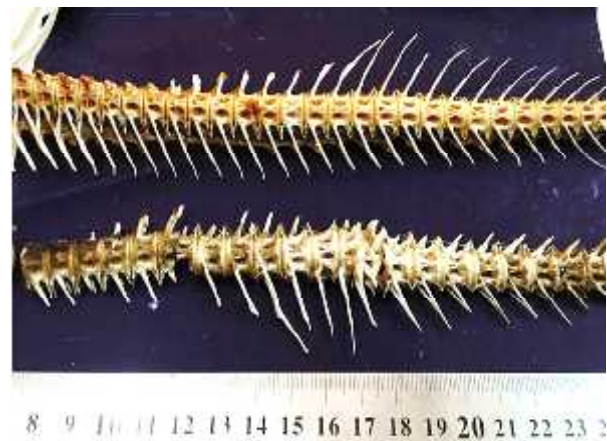
Fig. (4): Vertebral column of uninfected C. carpio (upper) and of infected fish (lower).