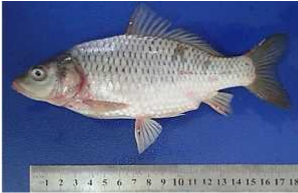
Fig. (1): Healthy C. carpio without any external signs of whirling disease.