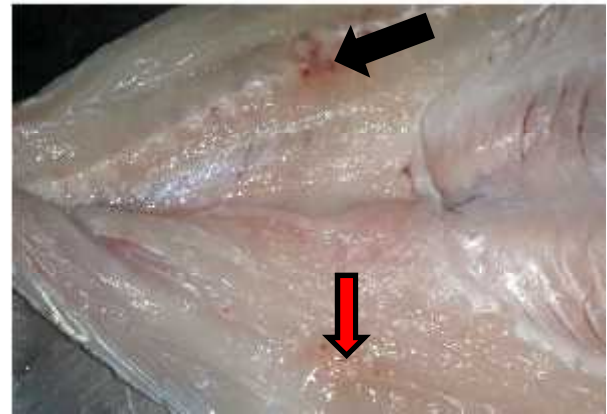
Fig. (3): Internal signs of whirling disease in an infected C. carpio . black arrow indicate red sores and red arrow indicates white sac of sporocysts.

Cross sections were prepared from the infected part of the vertebral column. The sections revealed that the spinal cord has its normal structure (Plate 1, white arrow), which consists of adipose tissue (plate 1, T) and inner tissue of the spinal cord (plate 1, S). Both tissues were found without any significant pathogenicity.