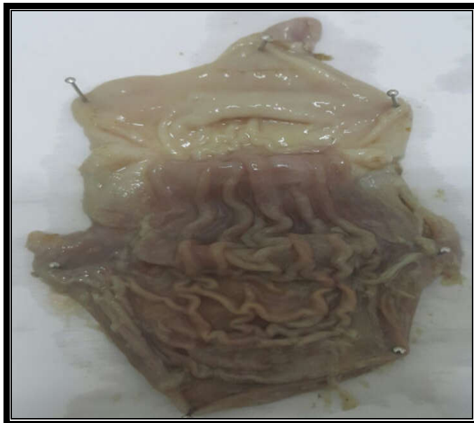
Figure 4- Stomach of male rabbits treated with(indomethacin 75mg/Kg for3 days + isolated alkaloid 300mg/Kg for 10days) .showed no lesionat all tissue of stomach