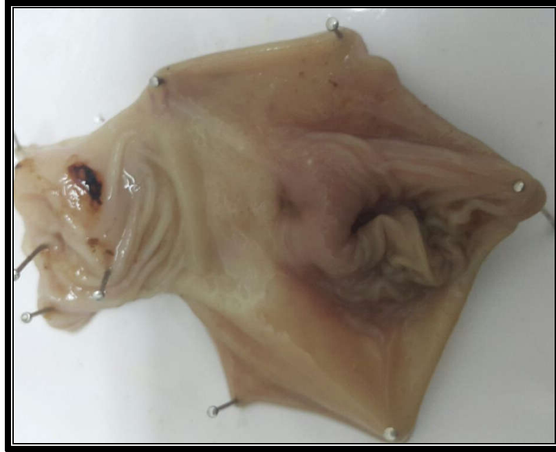
Figure 3: Stomach of male rabbits (treated for 3 days) indomethacin for induced gastric ulcer Showed gastric damage including gross mucosal lesion .