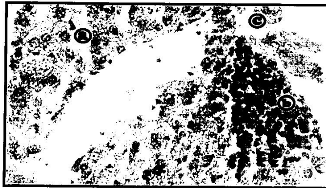
Fig. (5): T.S in Kidney of Mice infected with Cladosporium sp. showing: cell necrosis (a); granuloma (b) and blood coagulation (c). H&E satin (330X)