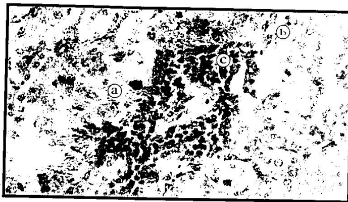
Fig. (2): T.S in Kidney of Mice infected with Cladosporium sp. showing: heavy bleeding (a); necrosis (b) and cell congestion (c). H&E satin (330X)