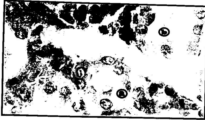
Fig. (3): T.S in Kidney of Mice infected with Cladosporium sp. showing: renal tubules necrosis (a); cell degeneration (b). H&E satin (396X)