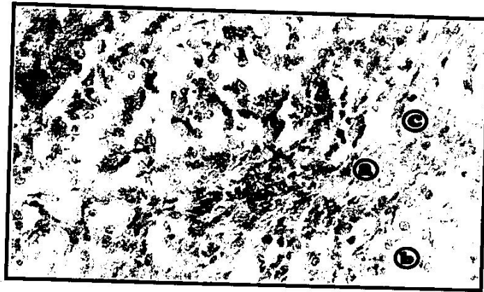
Fig. (1): T.S in Kidney of Mice infected with Cladosporium sp. showing: bleeding(a); renal tubules degeneration (b); Fungal mycelia (c). H&E satin (330X)

tubules necrosis was observed also in this study and this in line with the previous study on the fungus A. fumigatus ( 11 ). Aggregation of white blood cells also seen in infected areas. This may be as a result of presence of fungal spores which act as foreign bodies.