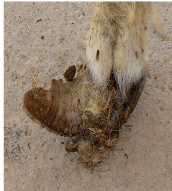
Pict. (4) Rings appeared on the hoof below the coronary band