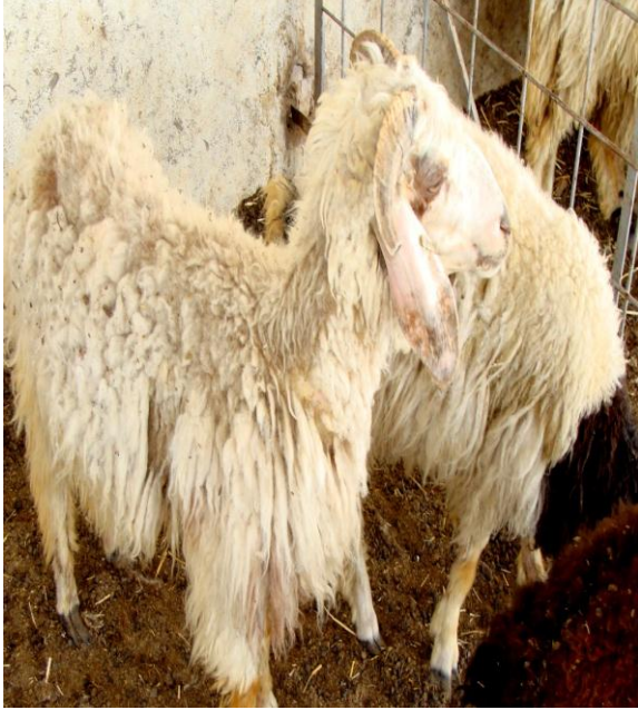
Pic.(1) Easily detached wool in lambs of the 1st group