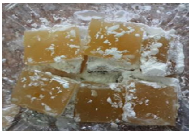
Figure 2. Functional delight supplemented with different levels of 15 mg extract

A stock solution of clementine peels was prepared by dissolving 1500 mg of crude extract in 10 ml of corn oil. The delight was prepared by using a formula consisting of 100g sucrose, 11.7 g corn starch, 12 g gelatin, 103 ml of water, and the crude extract was added at the end of cooking at levels 25, 50, 75, and 100 \mu l (based on preliminary experiments) to obtain 3.75, 7.50, 11.25 and 15 mg astaxanthin. 100 g of granulated sucrose was poured into the cooker with 37 ml cold water while stirring and the temperature was raised to boiling. Then, starch (11.7 g) was dissolved in approximately 35 ml of cold water and added to the previous sugar mixture. Moreover, gelatin was dissolved in 31 ml warm water and added to the mixture. At the end of cooking (10-15min) the crude extract was added as mentioned before. All of the delights were spread on trays covered with corn starch, left sitting for 24 h at room temperature and samples were cut by a knife and then delight samples were packed in polyethylene bags and stored at room temperature until further analysis (Fig.2).