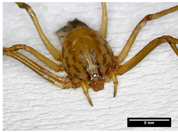
Figure (6): Chelicerae in female Scytodes univittata (400x)