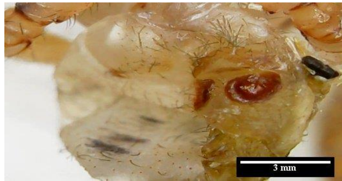
Figure (9): Upper view to Epigynum in female Scytodes univittata (400x)