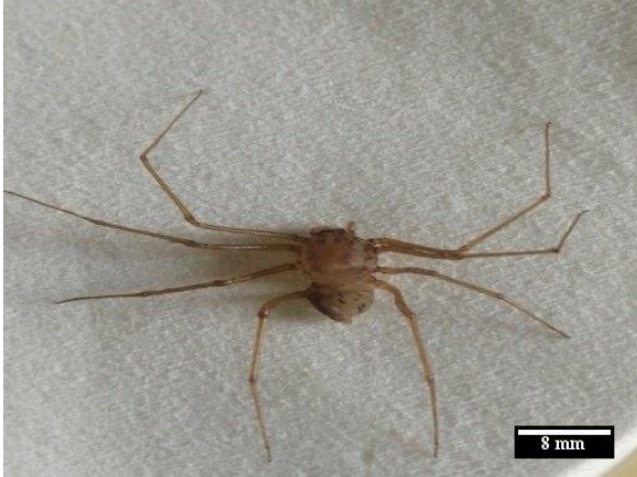
Figure (1): Dorsal side in female Scytodes univittata (100x)