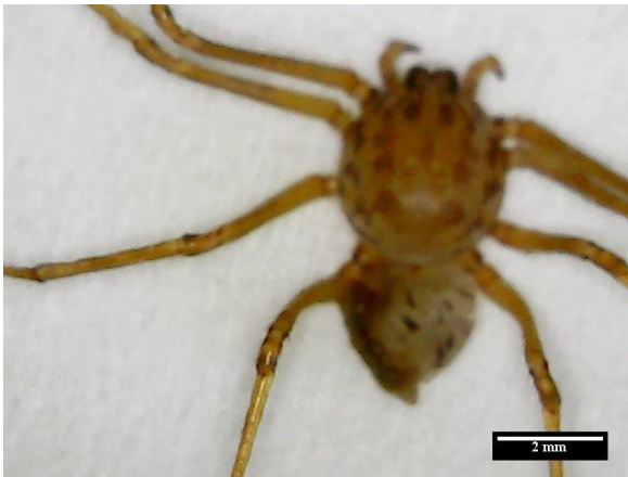
Figure (3): Cephalothorax in female Scytodes univittata (200x)