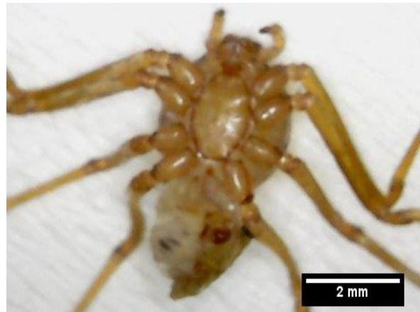
Figure (4): Coxosternal region in female Scytodes univittata (200x)