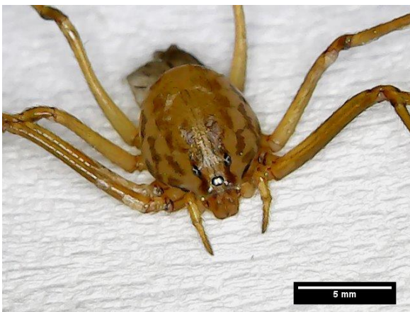
Figure (5): Eyes arrangements in female Scytodes univittata (400x)