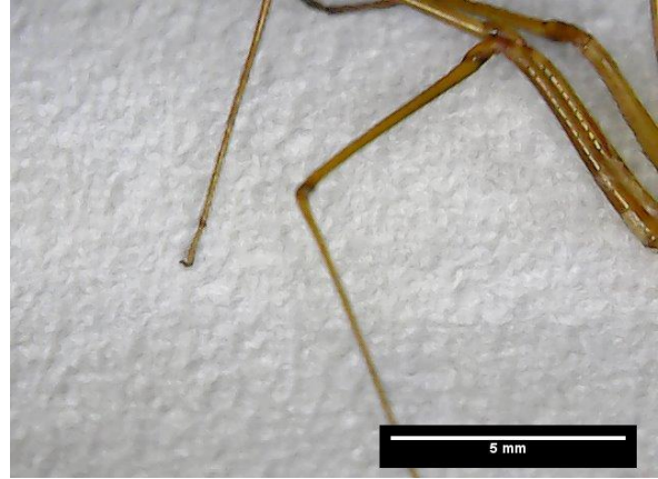
Figure (8): Third and fourth legs in female Scytodes univittata (400x)