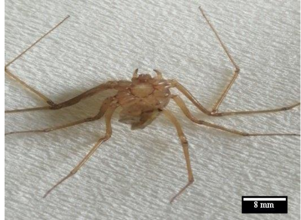
Figure (2): Ventral side in female Scytodes univittata (100x)