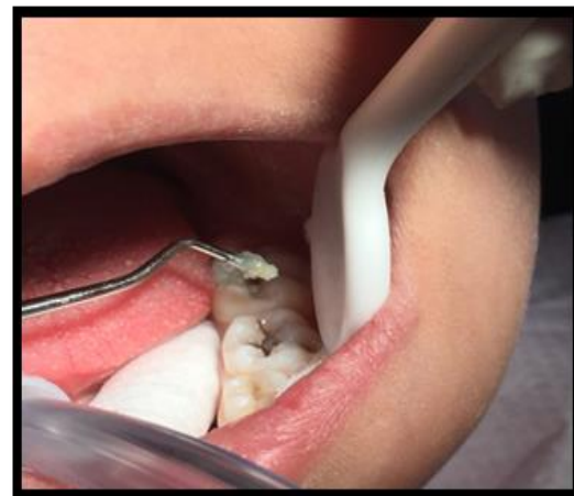
Fig. (2): Removal of carious dentine

had a positive behavior and 66.6% were with definitely positive behavior. In ceramic bur group, the percentage of the negative behavior was decreased to 3.3%, while positive and definitely positive was increased (90% and 6.6% respectively), Table 3, Fig. 3.