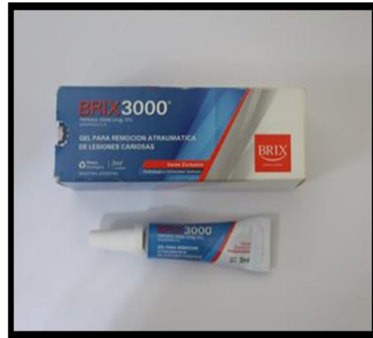
Fig. (1): Brix 3000

after the treatment period the percentage of negative behavior in the brix 3000 was 0% while 33.3%