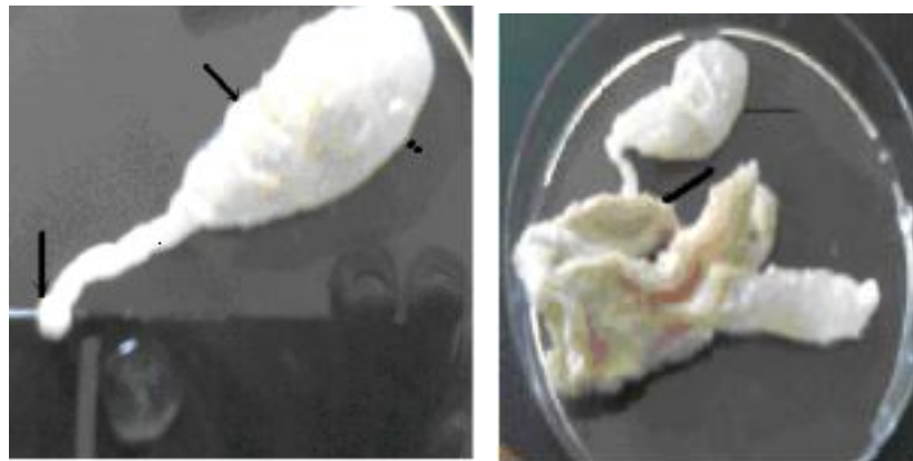
Fig.( 1 ) : Cysticercus tenuicollis bladder ,left higher arrow : parasite bladder; left lower arrow : single parasite scolex ; right thin arrow : parasite bladder ; right thick arrow : fibrous host capsule of parasite ( Normal size in Formal saline 10% ).