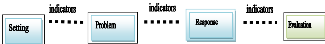
Fig (1) The rhetorical Relation by Signals (following Jordan, 1992: 180)

The rhetorical relation can be shown in the following figure: