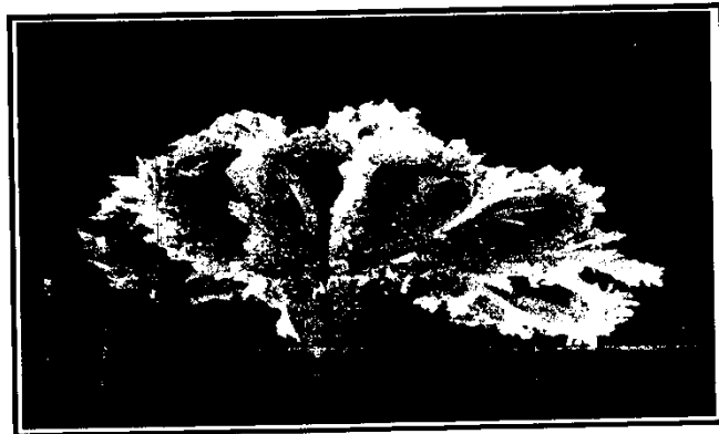
Fig . 1 : photographic representation of a corrosive cast of right renal artery show it's branches in adult sheep .

The branching pattern of interlobar arteries revealed in the present study was agree with that observed by willens and munster (1979) in Ruminant. Concerning of the ureter of the sheep in the present study had revealed that it was slightly large as well urine could normally seen in the renal pelvis , this result was different from results recorded by (5) and from cat recorded by (11). Who revealed that the urine could not normally seen in the renal pelvis because of the small size of ureter in rabbits and cats.