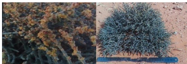
Figure 1: The Nitol plant Hammada articulate .