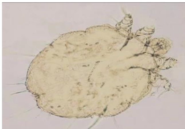
Figure 2: Sarcoptes scabiei parasite in the examined skin scrapings, 40X.