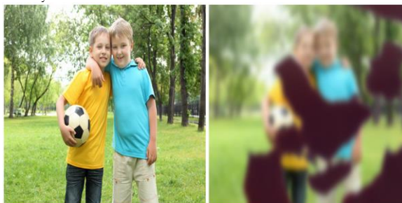
Figure (1): A patient with DR (right) and a healthy patient (left) experiencing the same eyesight [17].

give a new path via non-perfusion zones are examples of intraretinal microvascular abnormalities [15]. Patients with proliferative DR may experience severe visual impairment by tractional separation of the retina or by rupture of aberrant arteries into the vitreous (vitreous hemorrhage). Numerous of these abnormalities could be involved in the vision loss brought on by DR. Firstly, macular edema, which is defined as thickening or enlargement of the macula, can impair central vision. The collapse of the blood-retinal boundary leads to a buildup of fluid in the macula, which is what causes this swelling. Second, proliferative DR's new blood vessels and the fibrous tissue that surrounds them can contract, distorting the retina and causing tractional retinal detachment a condition that results in severe and frequently irreversible visual loss. Third, there's a chance that the newly formed blood vessels can bleed, which could result in vitreous or pre-retinal hemorrhage. The clinical avenues for vision loss depicted in Figure (1) include damage to retinal neurons in addition to these clearly visible vascular alterations.