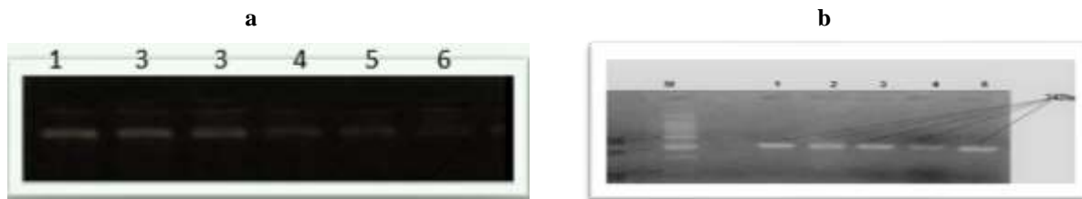
Fig. (1): a. Is representing the genomic DNA after extraction of hair samples by using organic extraction method, notice the faint bands pattern. Sample no: 6 gave no result. (Voltage70, Gel concentration: 0.8% agarose, Time 1: hrs).

agents (e.g., SDS, DTT) and proteinase K in lysis buffer for at least 14 hours or overnight average 0.4325 \mu\text{g} . While the average of DNA extracted from hair follicles was 1.4005 \mu\text{g} . There were faint and sometime unobvious bands that appeared after DNA extraction by using Phenol-chloroform method due to low concentrations but outcome of real time PCR indicate presence of minute amount of DNA and this amount was enough to give satisfying bands after PCR amplification of HV1 Figure (1).