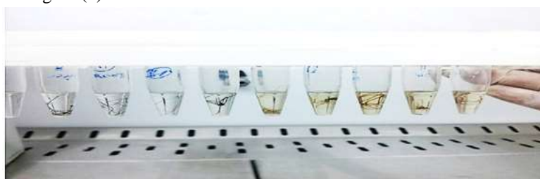
Fig. (2): Non-treated hair on the left and dyed hair samples on the right, later these dyes will interfere with sequence result (these figures represent a lysis step by using prepFiler forensic kit).

Isolation of mtDNA by using prepFiler Magnetic forensic DNA extraction kit was excellent choice to give a satisfying DNA concentration and purity for successful amplifying of mtDNA from biological hair samples including hair follicles Figure (2).