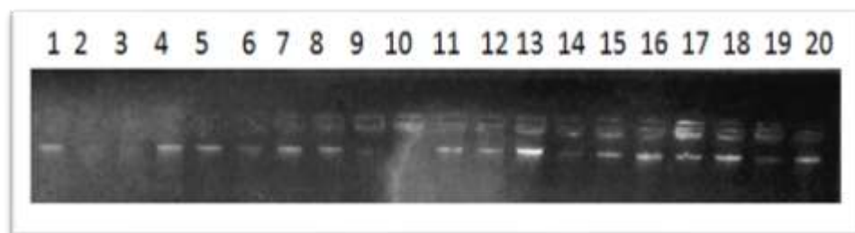
Fig. (3): Agarose Gel electrophoresis of DNA extracted from biological hair material by using prepFiler Magnetic forensic DNA extraction kit (Voltage70, Time: 1 hrs, Gel concentration: 0.8% agarose).

Irrespective to hair type category the average of DNA concentration was 10.917ng, may be because its protocol suitable for most of forensic sample types including stains and swabs of body fluids [17]. A sufficient bands pattern and integrity have appeared on agarose gel after extraction of DNA and subsequently these findings have affected the of bands pattern during gel electrophoresis appearing with faint bands Figure (3)