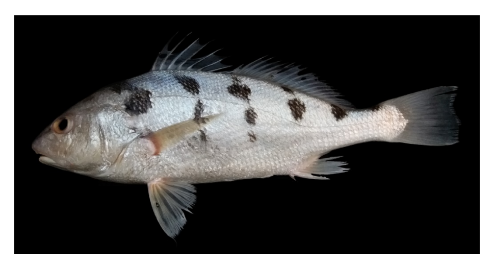
Fig. 3: N. maculate from the Iraqi marine waters.

(proceeding of 2<sup>nd</sup>International conference of science and Art –University of Babylon and Liverpool John Moores University, UK).