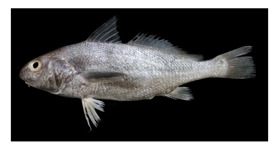
Fig. 2: J. amblycephalus from the Iraqi marine waters.

The bearded croaker (Fig. 2) is characterized by a moderately deep body (28.07 - 28.87 %) in Standard length). Snout is steep, bluntly rounded, projecting in front of upper jaw, mouth inferior, a stiff and blunt barbel on chin. Total length ranged from 216 to 230 mm. Head length ranged from 30.23 to 32.29 % in Standard length and head depth 19.98 - 25.32 %. The second and third spines fairly elongate (20.09 - 22.66%). Dorsal fin with 10 spines followed by a notch, second part of fin with one spine and 24 rays. The anal fin has two spines followed by seven rays. Caudal fin slightly rhomboidal. Gill rakers ranged from three to four on upper limb and eight on lower limb of first gill arch (Table 1).