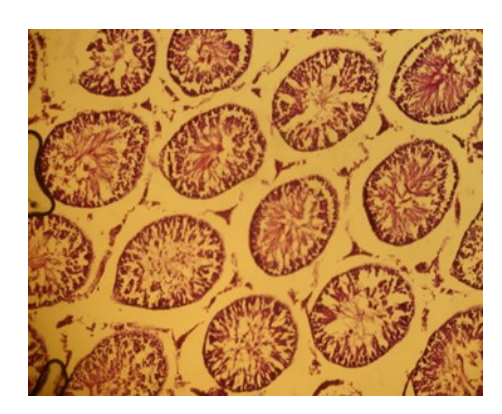
Figure 3: Rat seminiferous tubules. Relative hypotrophy in seminiferous (1), enlargement in interstitial spaces (2) and a decrease in the number of Leydig's cells (3). Stained with H&E.200X. (Second treated group).