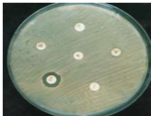
MRSA and VRSA on muller-hinton agar