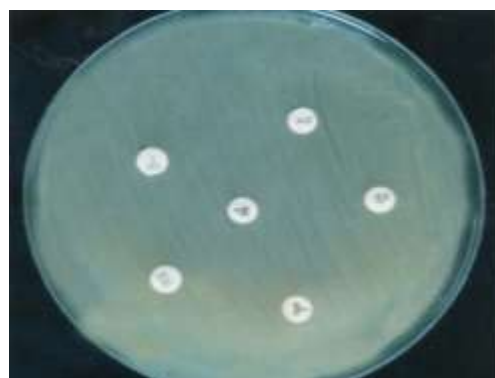
VISA on muller-hinton agar