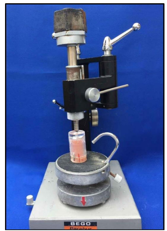
Figure2: Impression taking with the dental surveyor.