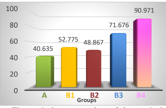
Figure 6: the mean values of the vertical marginal gap of all groups.

Table 4 showed that there was a statistically highly significant difference in the vertical marginal gap between digital and conventional impression.