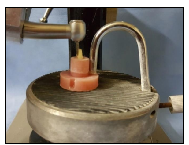
Figure 1: Tooth preparation using a modified dental surveyor.

The same pouring procedure was repeated for subgroups B1, B2, B3, and B4 after the storage of impressions at different times (30 minutes, 24 hours, 7 days, and 14 days respectively) in an incubator at room temperature (25°C) according to the manufacturer's instructions.