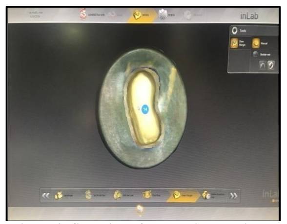
Figure 3: Scanning of teeth using omnicam scanner