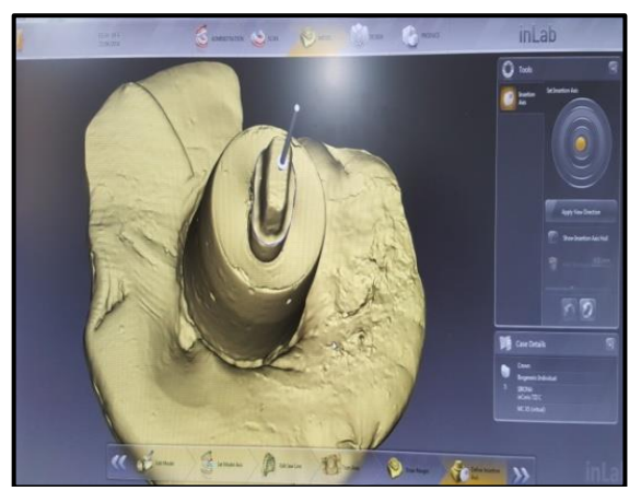
Figure 4: Scanning of die stone using inEos X5 Blue scanner