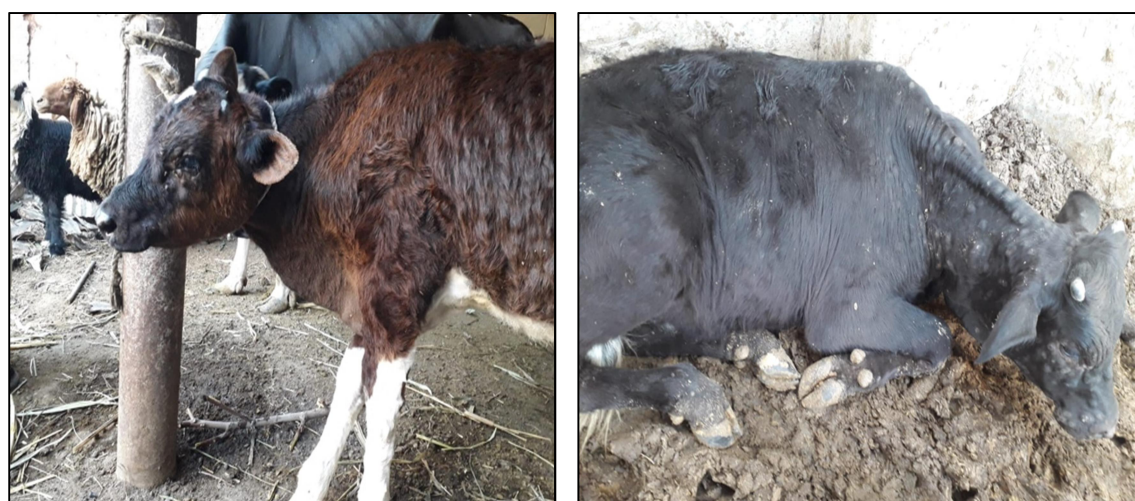
Figure 1. Clinical pictures of Lumpy skin disease in young and adult cattle shows clear skin nodules displayed on the head, neck, and body.

* Significant found using Pearson's chi-square tests ( P \leq 0.05 ).