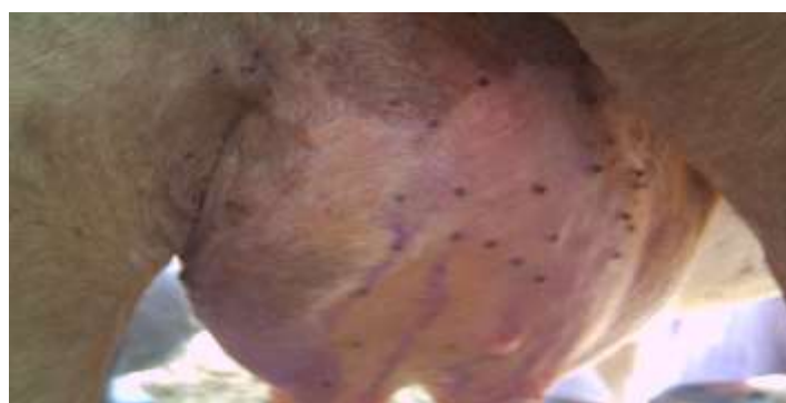
Figure 3 reveal the infestation of udder region