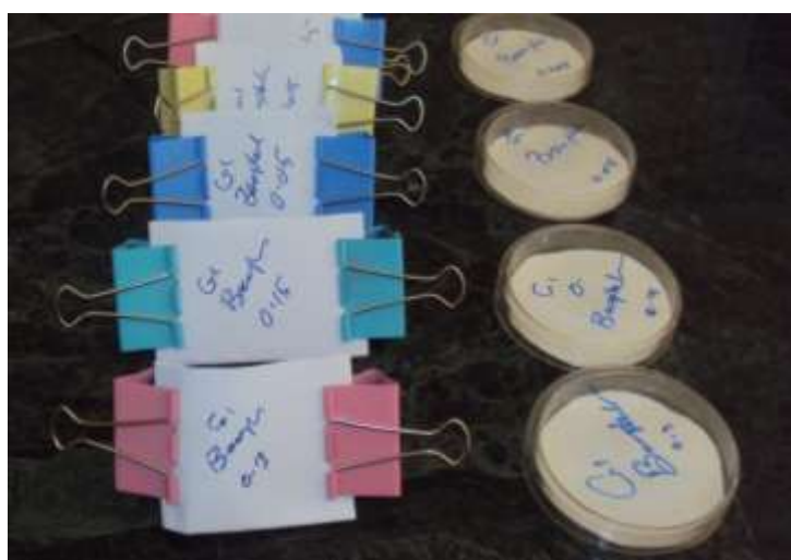
Figure 2 reveal the LPT method (left) and MLPT method (right)