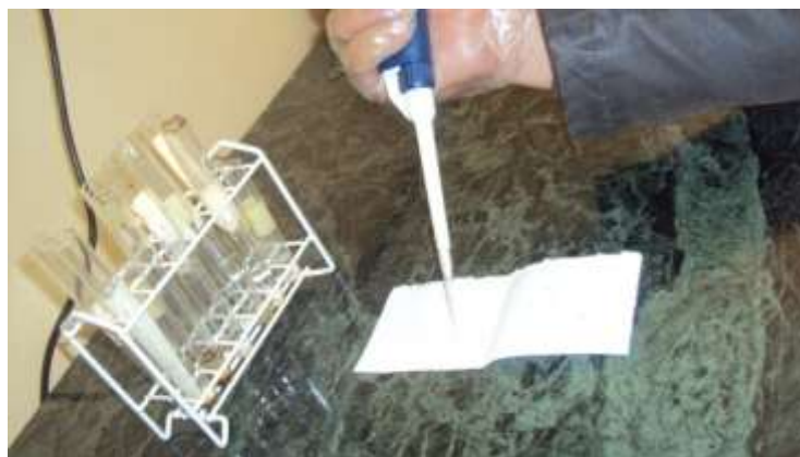
Figure 1 reveal the streaking of filter paper with cypermethrine by micro pipette

considered as live. Also, One control packet was prepared for each method by impregnated it with solvent only.