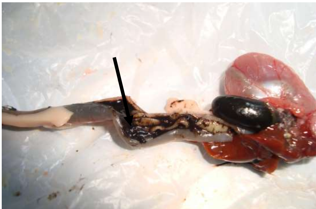
Fig (1) Choanotaenia masculosa (arrow) was identified in the intestinal tract of starling.