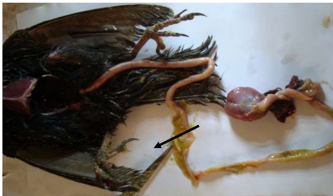
Fig (2) Acanthocephalan spp. (arrow) was identified in the intestinal tract of starling.