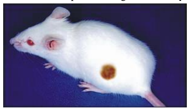
Image (2) Healing of wound by mixture (Honey , Nigella sativa oil , propolis)

The results reported in the figure (1), indicate that the wounds treated with mixture showed complete healing after 2-3 days (Image 2)