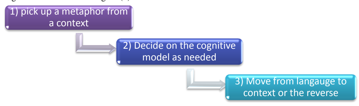
Figure (1) Steps of metaphor analysis in the dual approach

The steps that are followed in analyzing metaphor using the dual approach can be diagrammed as shown in Figure (1):