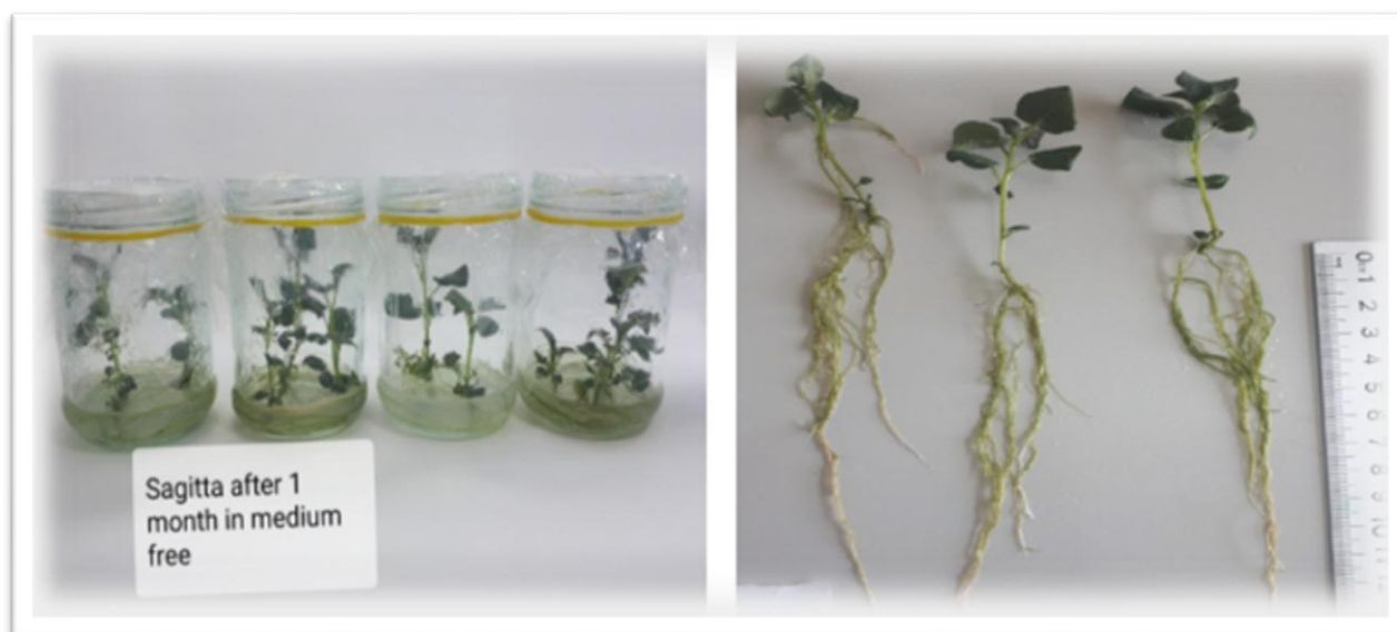
Figure (2): plantlets after 30 days of cultivation in culture medium