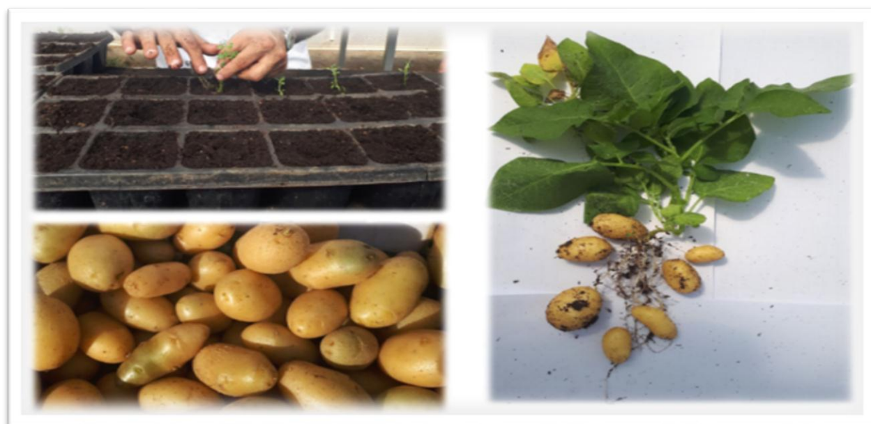
Figure (3): Minitubers production under greenhouses conditions (after 75 days of cultivation in peatmoss)