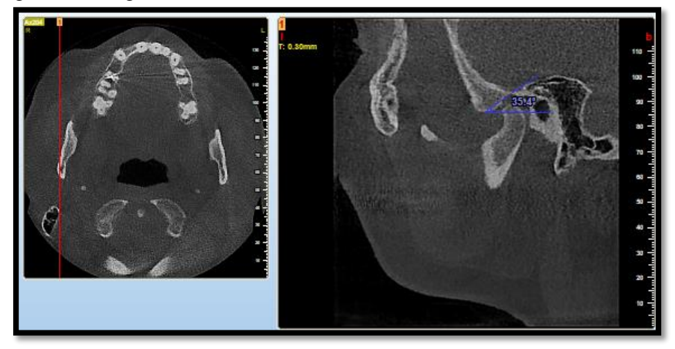
Figure 1: The measurement of articular eminence inclination in right side of 33 years old female on CBCT in sagittal section by method (top-roof line).

One investigator used CBCT pictures to measure articular eminence height and inclination.