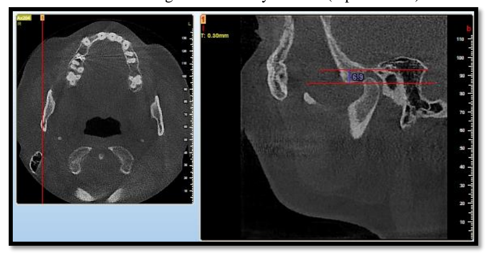
Figure 2: The measurement of articular eminence height in right side of 33 years old female on CBCT in sagittal section.