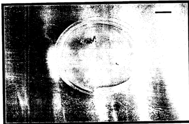
Fig.3. Trichophyton verrucosum . Two weeks old Colonies on SDA medium (Bar = 1 cm).