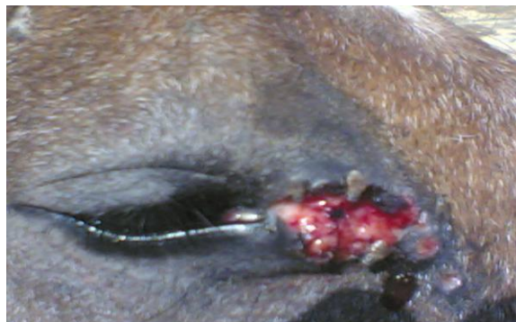
Photo 3. Rubbing eyes against hard objects with cogregation of flies