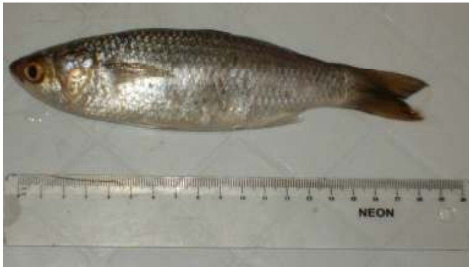
Fig. 1 Liza subviridis with 180 mm total length.