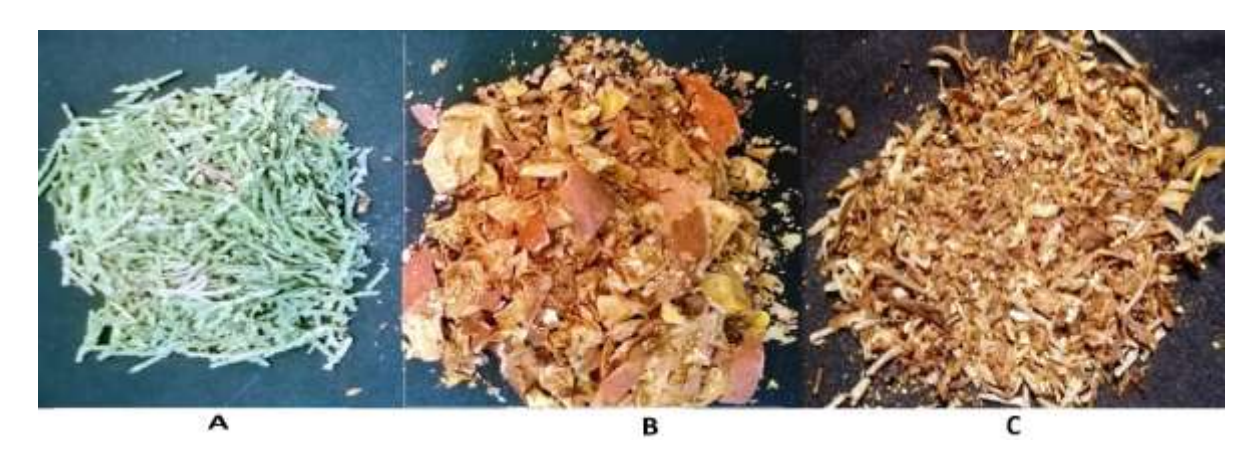
Figure (1): A- Thuja leaves, B-The pomegranate fruit peels and C- Tobacco leaves were naturally dried under the sun's rays

All the data obtained from the study were entered into the SPSS statistical program, version 22, to find out the effect of the variables on each other at a significant value P \le 0.05 .