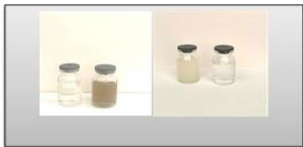
Figure 1. The color change during the synthesis of silver nanoparticles by the S. bouldardii . A- Silver nitrate solution + S. bouldardii solution after 1 hour. B- Silver nitrate solution only. C- Silver nitrate solution + S. bouldardii solution after 120 hours.

The rate of reduction and nanoparticle formation can be further increased by increasing the incubation time under experimentally controlled conditions. The reason for the color change can be explained by the role of yeast, as well as the plant, in manufacturing nanoparticles, as the yeast and plant absorb metal ions from the environment or the solutions surrounding them and convert these metal ions into the form of a nano-sized element through enzymatic reduction. The change in color also indicates the excitation of surface plasmon vibrations in metal nanoparticles. Silver nanoparticles, the rate of reduction and formation of nanoparticles can also be increased further by increasing the incubation time under experimentally controlled conditions, and thus the color intensity increases with increasing reaction time. This shows interesting optical properties that are directly related to the surface plasmon resonance, which depend greatly on the appearance of the nanoparticles. Thus, the color intensity increases with increasing reaction time, as illustrated in Figures. 1 and 2.