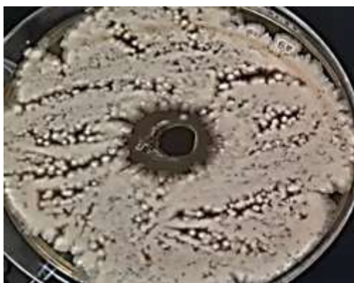
Fig.3: Antimicrobial activity of the crude chloroform extract by agar well diffusion method against C.albicans at 37°C for 2 days.