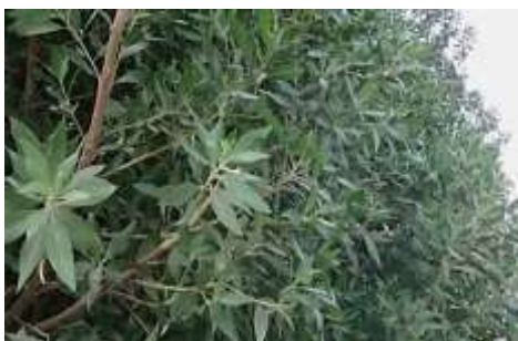
Fig.1: Conocarpus spp tree.

bioactivity. The bioactivity test repeated more than three times and by triplicate for each microorganism.