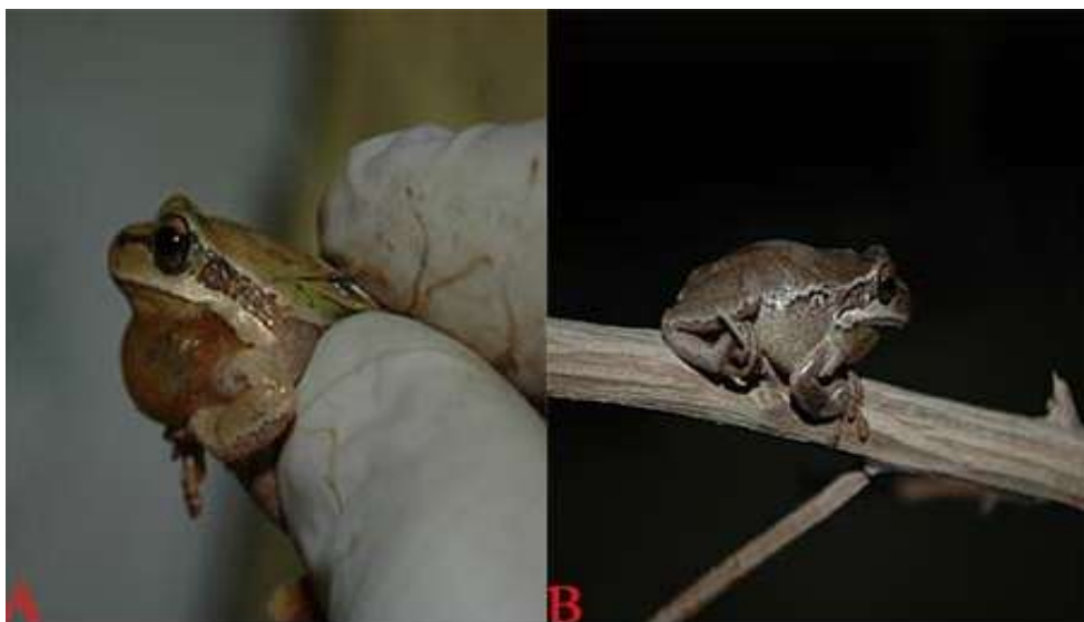
Fig. 2. Hyla savignyi . (A) Males have large obvious brownish vocal sac, (B) ventral views