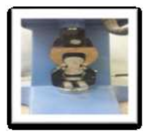
Figure 1: Tool for tension strength test