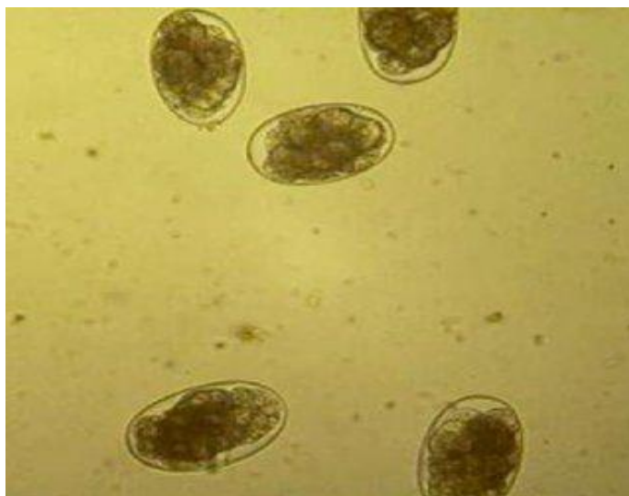
Figure (2): The egg shape of Haemonchus contortus .

https://www.researchgate.net/publication/262932569_Efficacy_and_Safety_of_Albendazole_against_Haemonchus_Contortus_Infection_in_Goats/figures?lo=1&utm_source=google&utm_medium=organic