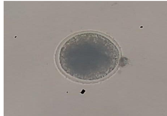
Appearance of the first polar body