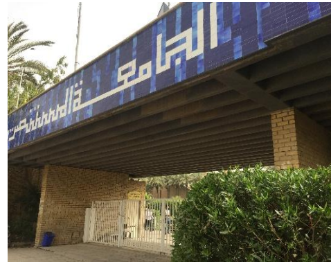
B. Mustansiriyah University (author)