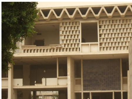
Figure 3. A. embassy of U.S.A Al-Sultani 2014, p.78

Also meant to deal with weather influences but architects used different types and sizes of louvers in modern building in Baghdad, as we see in the campus of Baghdad university by Gropius, and mixture of louvers and screens in the elevations of the embassy of the United States in Baghdad by Sert Fig.3 .