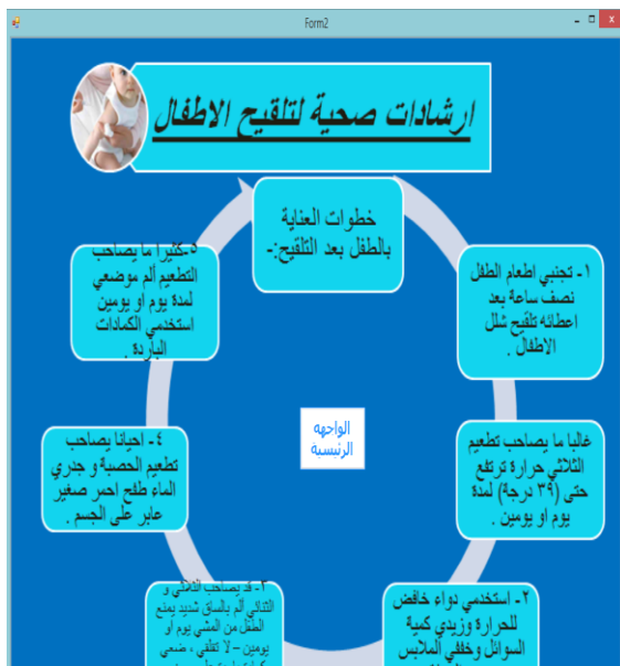
Figure(7) Health Guidelines