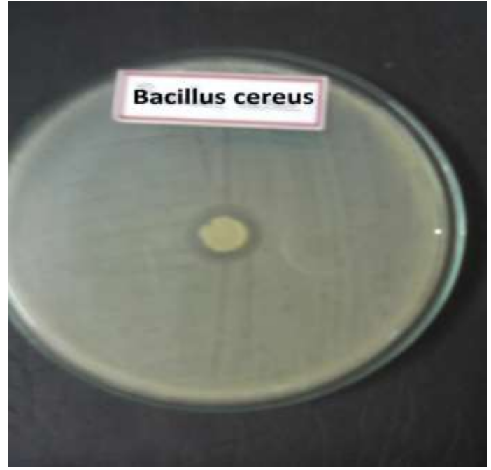
Figure (2) Effect of Lactococcuslactissubsp. LactisonBacillus cereus.

Isolation and Characterization of Nisin-Like Peptide Produced by Lactococcuslactis Isolated from Indian Curd