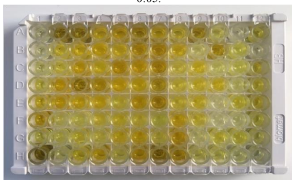
Fig. (1): IgE screening results for E. vermicularis and healthy individuals using ELISA

* There are significant differences at the probability level 0.05.