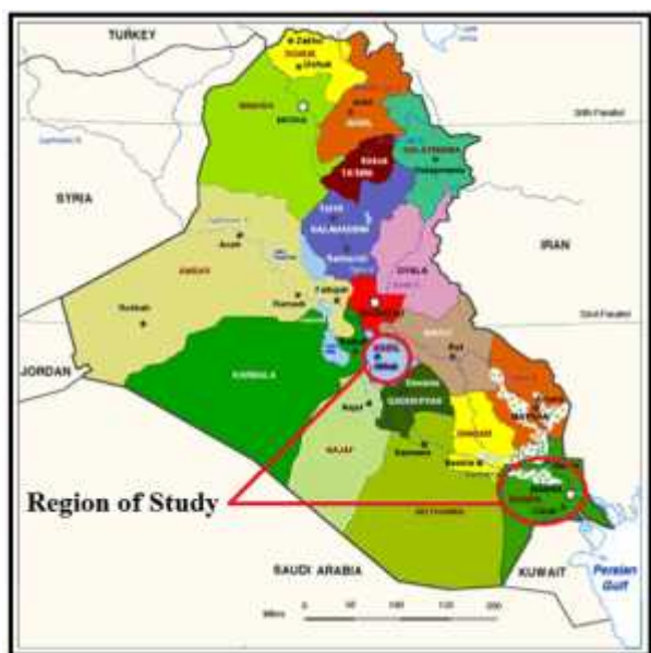
Figure (1): Map of Iraq showing location of the study.

Where the symbols x and s represents the unknown and the standard, respectively; U is the uranium concentration in ( \mu\text{g kg}^{-1} ); \rho is the density of the induced fission tracks in ( \text{track} / \text{mm}^2 ). The details of the technique are the same as reported [1], [2], [3].