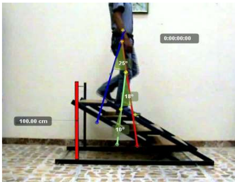
Figure (12) the experimental set-up and the angles arrangement a video camera recorded the spatial positions of Circular passive markers.