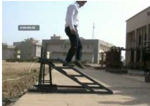
Figure (7) Forward continuance phase.