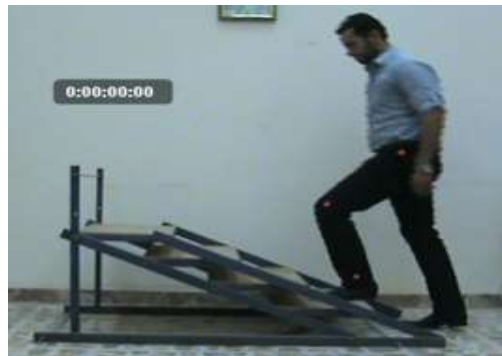
Figure (1) Weight acceptance phase.