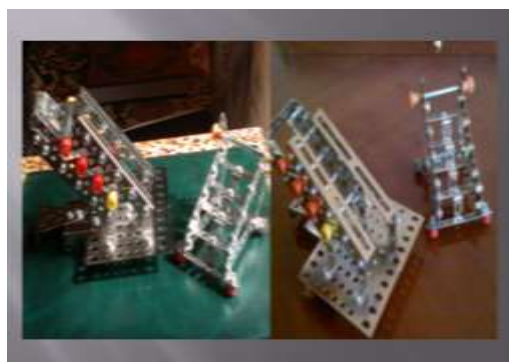
Figure (11) Staircase prototype.