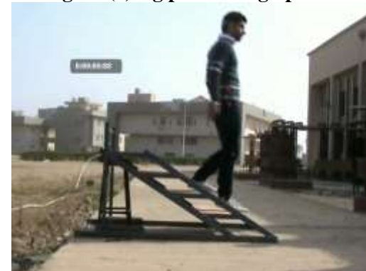
Figure (10) foot placement phase.