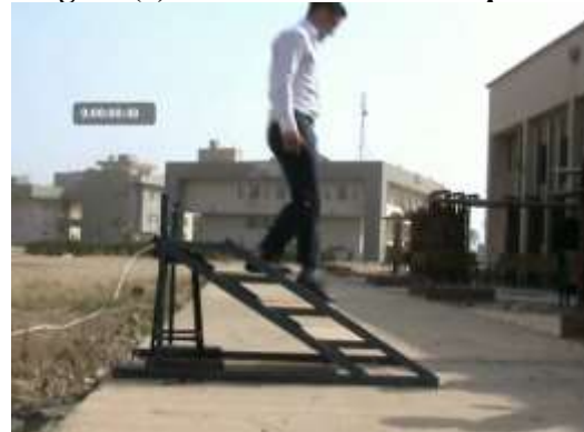
Figure (8) Controlled lowering phase.