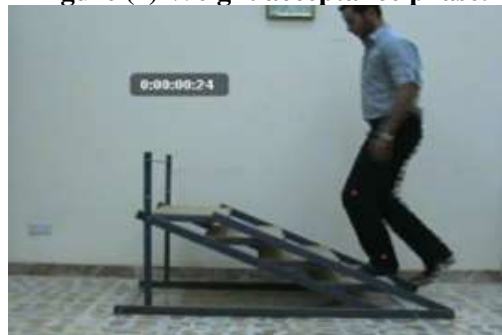
Figure (2) Pull-up phase.