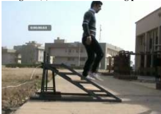
Figure (9) leg pull through phase.