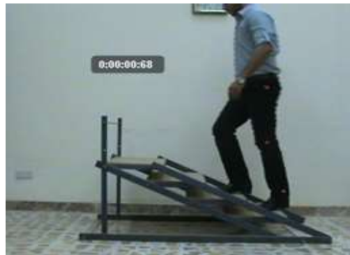
Figure (3) Forward continuance phase.