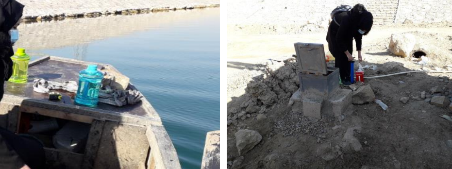
Fig. 2. Water extraction process from three wells and AL Warrar canal

Depending on the data of three wells drilled in the right bank to Al Warrar canal in Al-Ta'meem district. 95 water samples of the same depth were collected from five different sites (19 samples each). The sample collection procedure conducted on January/ 1<sup>st</sup> 2021 between 11 and 12 pm. The five sites were distributed as follows: three of these sites are wells that have been drilled, and the other two sites are in the middle and on the canal bank. Sample storage was done by using high-quality plastic bottles tightly closed and kept at 4°C before the test process. These samples tested in the laboratories of the Science College, Fig. 2.