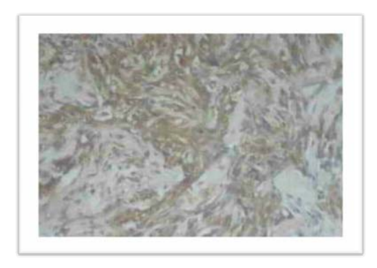
Figure 2: MMP expression in a jaw osteosarcoma (X100)