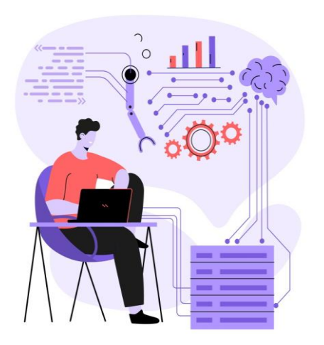
Figure 6: Artificial Intelligence in Engineering, [14].