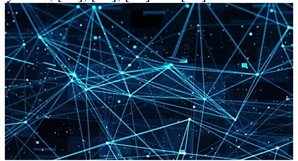
Figure 5: How Electrical Engineering is Driving the Future of Artificial Intelligence, [14].

As we advance into a technologically driven society the combination of Artificial intelligence and electrical engineering will further open the possibilities for what can be done for this field in the future. This ongoing evolution is once again the key to even higher degrees of efficiency to be expected within a wide variety of applications of electrical systems, [18], [15], [14] and [23].