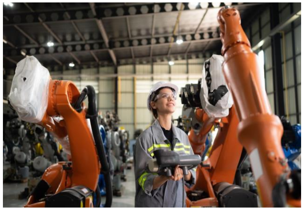
Figure 3: The Role of AI in Engineering Innovation, [6].