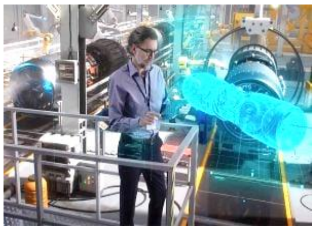
Figure 1 : Engineers who learn to specialize in AI are increasingly sought after to leverage new technologies across various industries, [24].

enhancing the efficiency in terms of organizational outputs and facilitating innovative solutions cutting across different fields of engineering, [24], [1], [11] and [3].