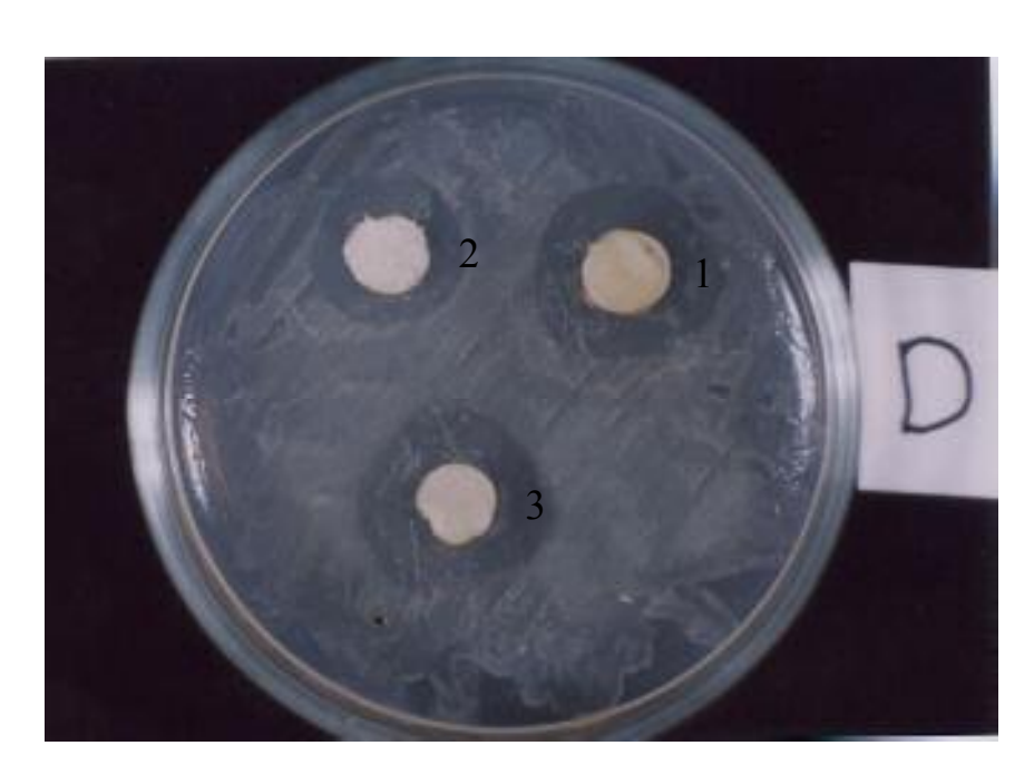
D: Staphylococcus aureus (ethanol extract ).