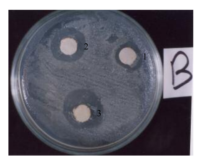
B: Escherichia coli (ethanol extract ).