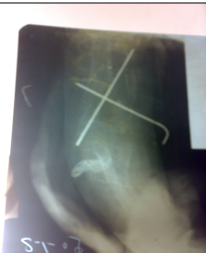
Figure(5), Postoperative, anteroposterior view of supracondylar fracture group 1