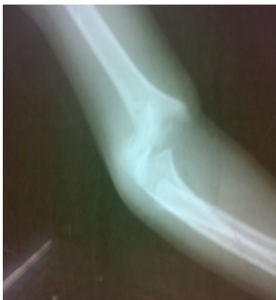
figure(3) supracondylar fracture anteroposterior view group 1