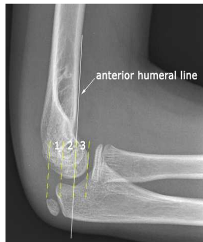
Figure (2) Lateral view of normal elbow joint