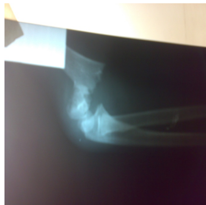
Figure(4), supracondylar fracture lateral view group1