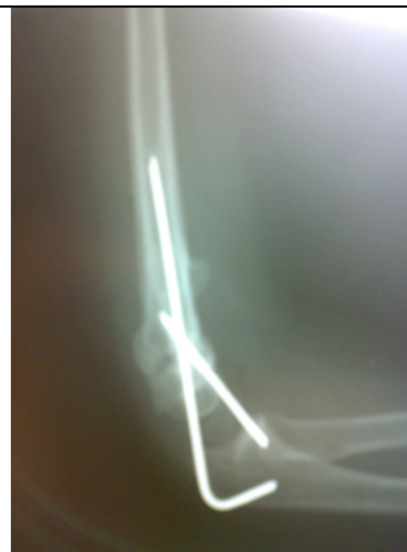
Figure(6), Postoperative lateral view of supracondylar fracture group 2