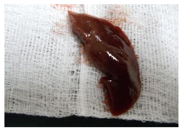
Fig. (2): Part of liver cut and removed (partial hepatectomy)