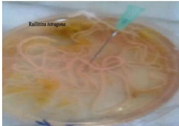
Fig. (1): Showing the interanl parasite ( Raillietina tetragona ) has been takeoff from small intestine.