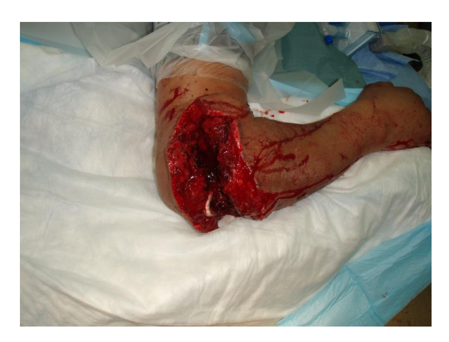
Figure 1: Gustilo IIIA compound fracture.