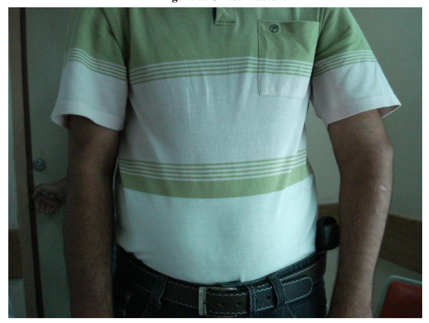
Figure 6: Elbow in extension post injury.