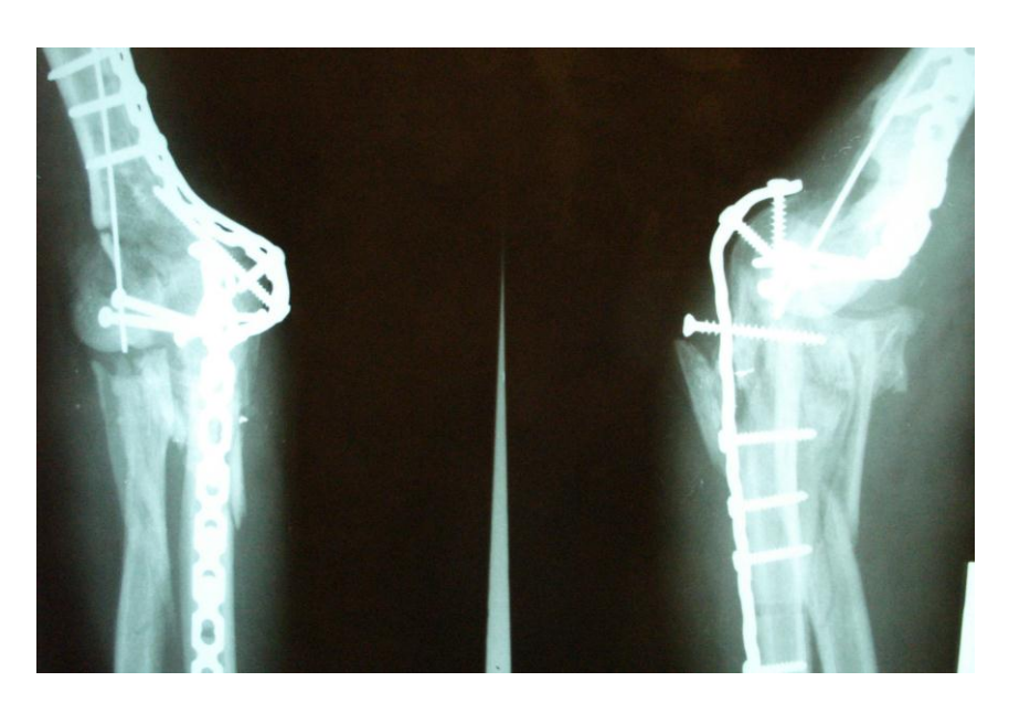
Figure 3: Internal fixation may lead to severe loss of function.