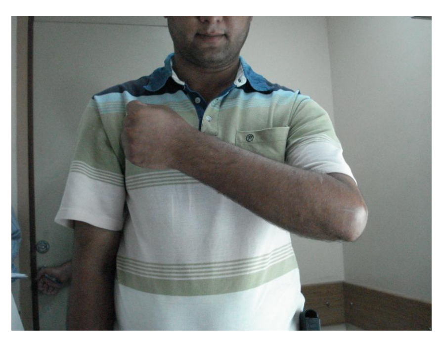
Figure 7: Elbow in flexion.